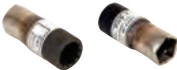
7/8" Hex Socket 7/8" Penta Socket 02290772