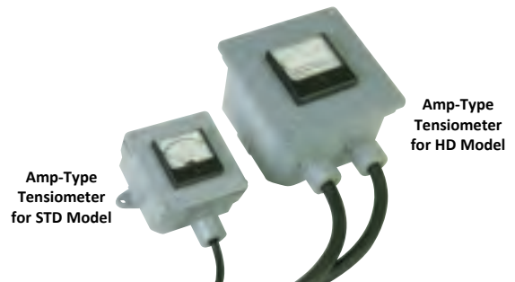
Amp-Type Tensiometer for STD Model