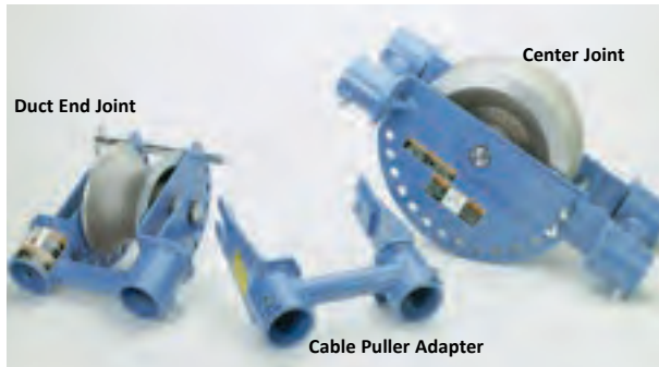
Extension Frame Kit for CableGlider HD Model