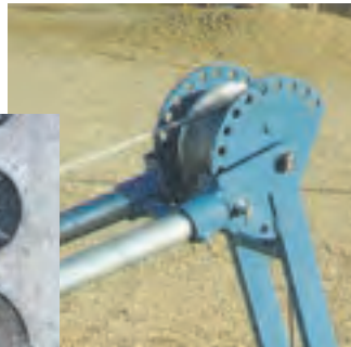
Cable Puller Adapter