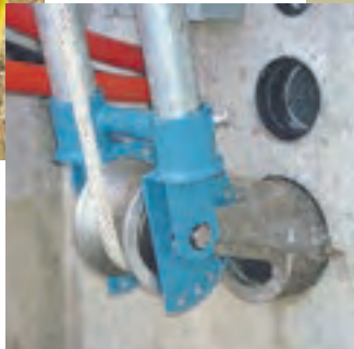
Duct End Joint