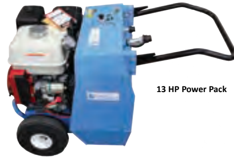
13 HP Power Pack

This portable power source is matched perfectly to the power requirements of the Condux Fiber Optic Cable Puller and the Fiber Optic Cable Blower. See the chart below for specifications.