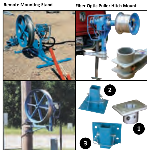
Adjustable Hitch Mount 22.5°