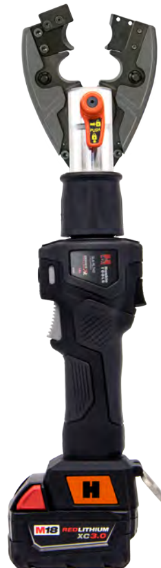
6-TON INLINE SLA-RL7ND w/ EVS-NDCUTJAW