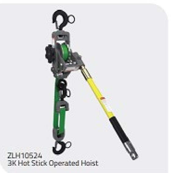
SEE MANUAL FOR PARTS DIAGRAM