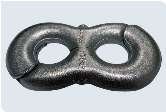
FIGURE OF 8 'SWING LINK' CONNECTOR